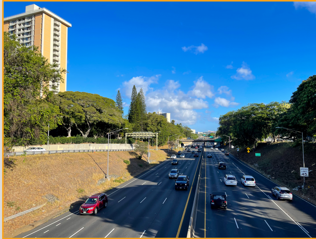
H-1 West from Pali