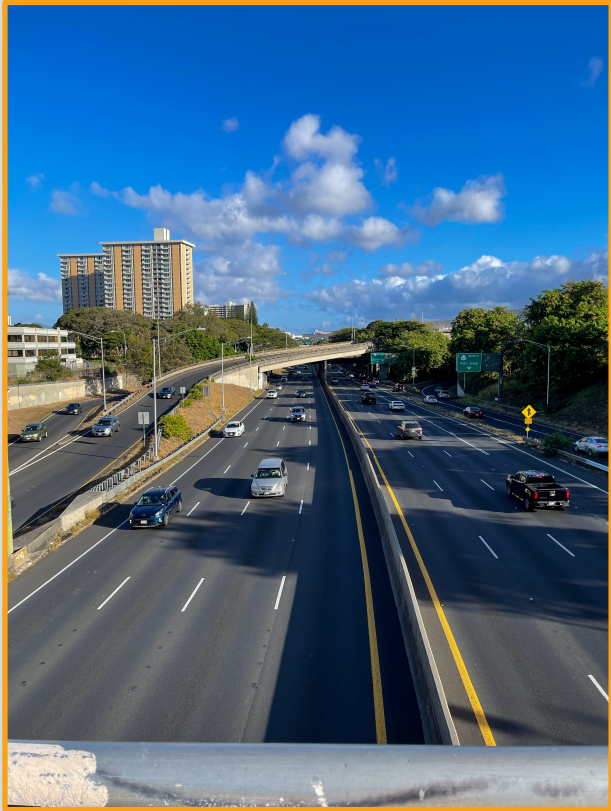
H-1 West from Queen Emma