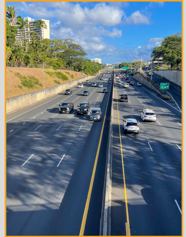
H-1 West from Nu'uanu